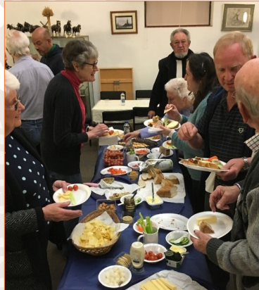
Cheese & Wine – April 2018